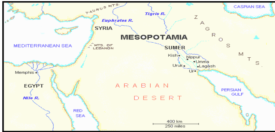
Figure 1. Map showing the territories of Mesopotamia (wikispaces.com)

region through the cultural interaction between people (Sener, 2004). Location of Mesopotamia is shown in Figure 1 (wikispaces.com).